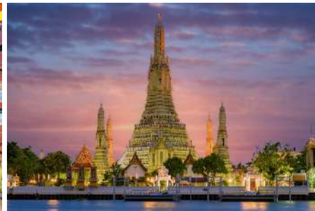
Overnight in BANGKOK