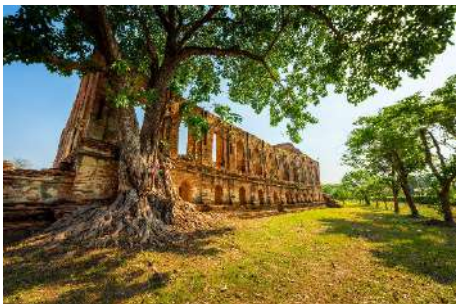
Note: Kindly be aware that proper attire is required to enter the Ayutthaya Historical Temples; Thailand Journeys staff will be pleased to advise you accordingly.

Transfer to Bangkok Airport for your afternoon flight to Chiang Rai (flight TBA / Included).